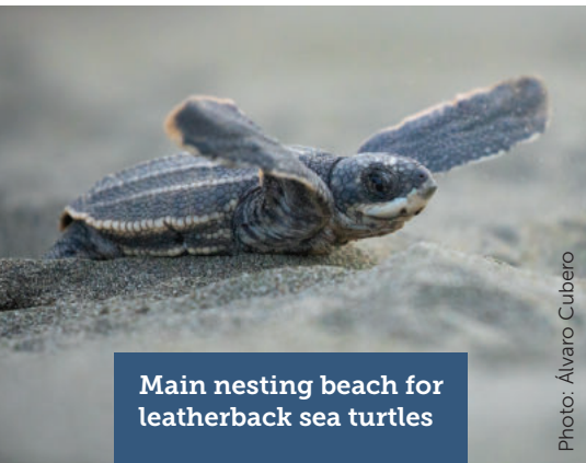
Main nesting beach for leatherback sea turtles

In alignment with EPI's mission, Pacuare Reserve seeks to promote sustainability its operations and positively impact development of the surrounding communities through educational programs, ecotourism, volunteering, and biodiversity research.