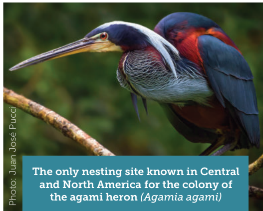
The only nesting site known in Central and North America for the colony of the agami heron ( Agamia agami )