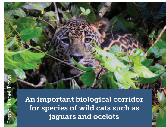
An important biological corridor for species of wild cats such as jaguars and ocelots